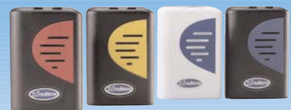
RPR750 paging receivers

Access 3000, the world's most versatile paging messaging and control system. When there is no room for error, it delivers fast, accurate information to the palm of your hand, allowing you to focus on your number one priority - the emergency, patient, or task-in-hand.